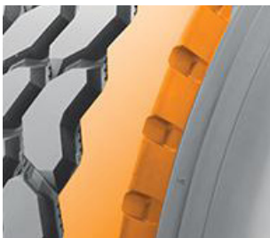
WIDE OUTER RIBS Provide on-road stability.